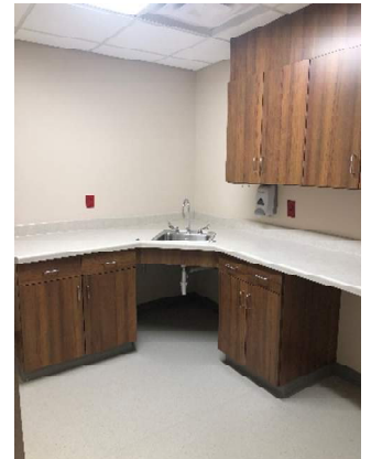
The three photos above depict the lower level Clinic / Med Surge addition. It is another sneak peak of the nearly complete space! The owner accessories have been installed and makes the patient rooms look ready for use!