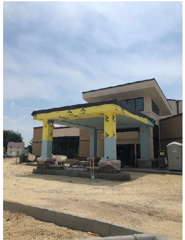
The new main entrance canopy is coming along! The curb and gutter has been installed around it and the sliding aluminum entrance doors.