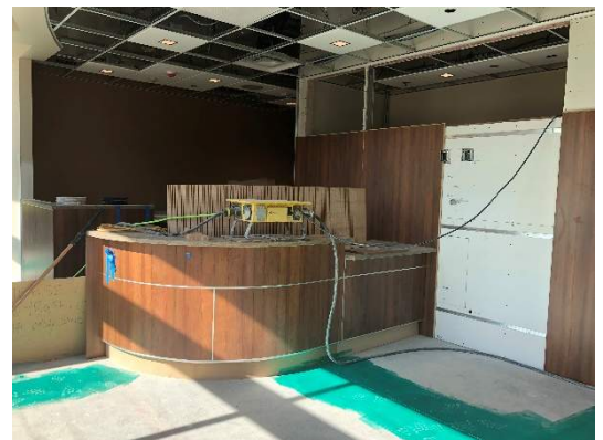
The photos above and below are various views as one walks in the main entrance and into the Main Street addition! Also pictured is the progress on the Grand Stair, railings are being installed.