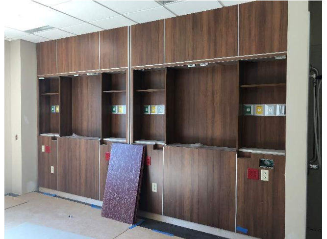
The photos above show the progress update on the upper level Clinic / Med Surge addition. The bathrooms have ceramic tile installed along with fixtures and accessories, millwork and wall protection has been installed, and within the patient rooms the 3form wheat panels are being installed within the headwall units!