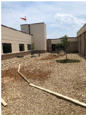
A view into the courtyard which separates the new building from the existing building.