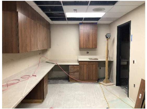
The photos above depict the new Outpatient Clinic! The walls have received their first coat of paint and the millwork has been installed. You can see the handles on the millwork are put on backwards. This is to protect them while construction is still ongoing. When most of the trades are complete in the space, the handles will be installed on the front size.