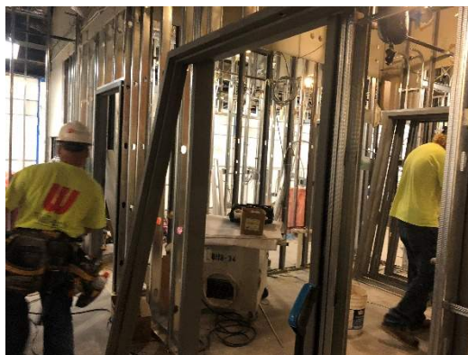
A few photos peering into the new ER Nurse Station. Stud walls have been installed and MEP rough ins are nearly complete! The space will be ready for drywall installation soon.